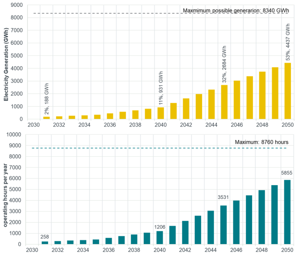
Figure 3 Electricity generation and operating hours